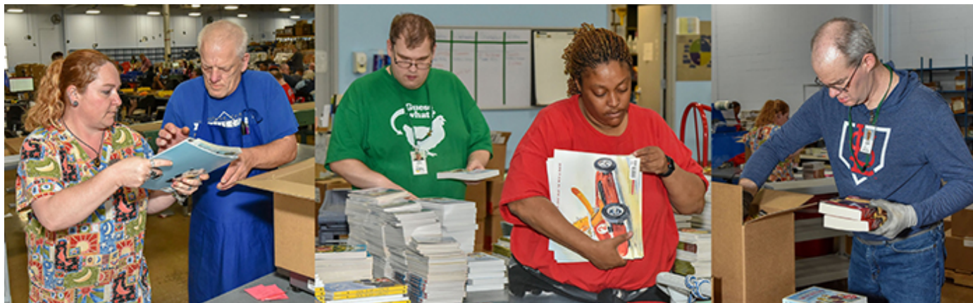
BJC partners with Valley Industries, a sheltered workshop that employs community members with developmental disabilities, to package and distribute the books donated to local second-graders through the BJC Book Brigade program.